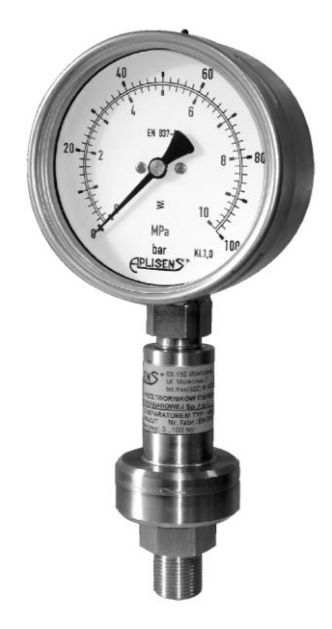
Draw.1. MS-100K industrial manometer